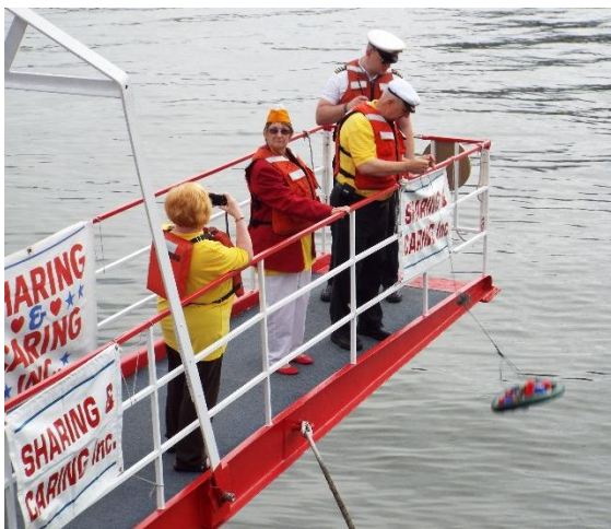
The Cooties was given the honor to drop a memorial wreath at The Point`