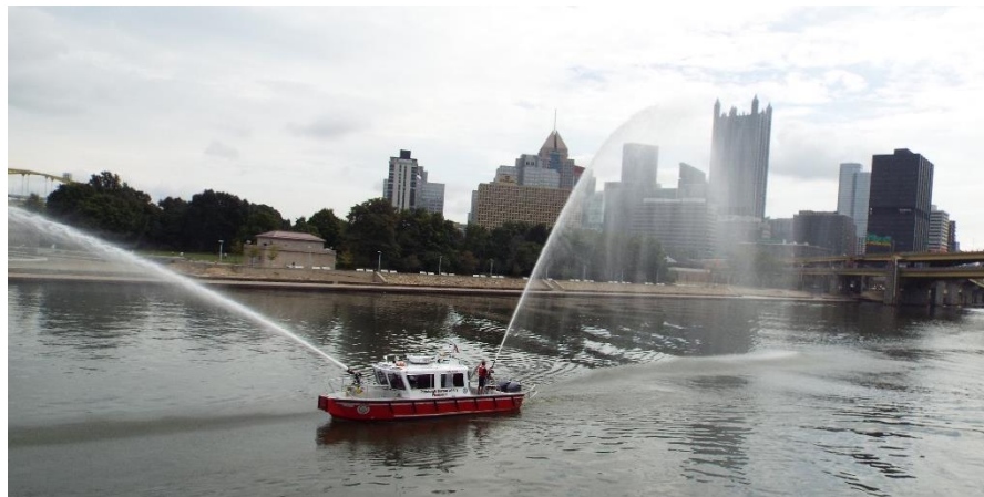
The Pittsburgh Fire Department River Patrol display tribute to the Veterans