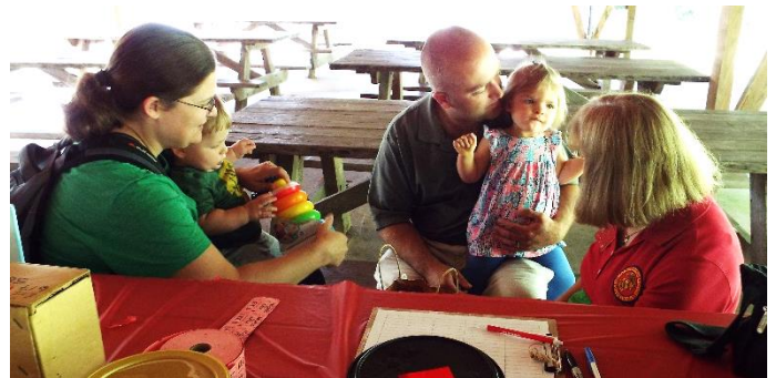
The Imbragno Family